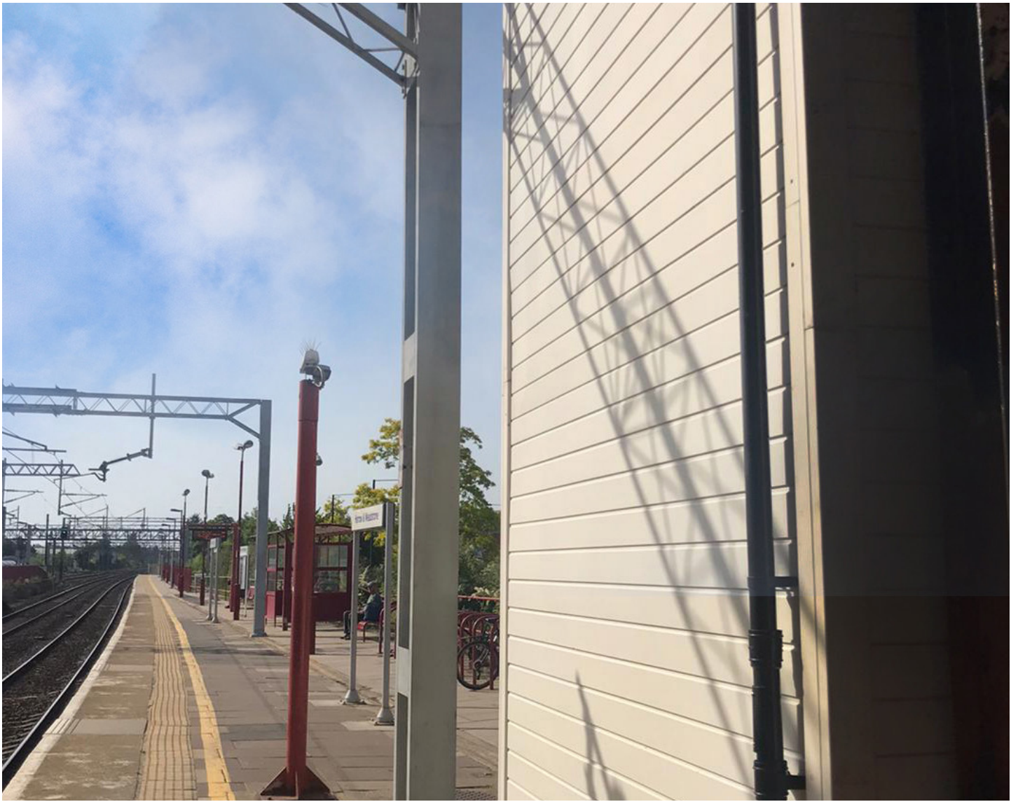
Completed lift shaft cladding