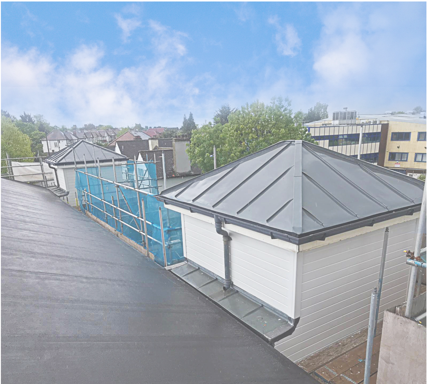
Roofing Details felt and standing seam

In 2019, a £3.4 million overhaul of the station commenced and Everlast was awarded separate contracts for two major schemes within the project. The first, awarded direct by Network Rail, was for repair of the roof and ceiling of the Grade II listed ticket hall. The other, awarded to Everlast by principal contractor J Murphy & Son, was the re-roofing of the footbridge that spans all platforms, and re-cladding of its four lift towers. The station remained operational and open to passengers throughout both contracts.